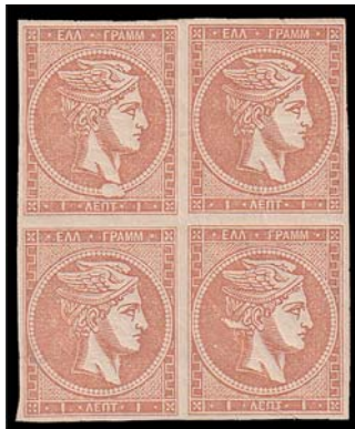
1066 ★★/★ 1880-1886 ATHENS ISSUE ON YELLOWISH OR CREAM PAPER (67), 1 lep. in B4 Pos. 44-45, 54-55. Two pos. with broken plate, gum creases. 3 stamps without hinge. F . . . . . 30