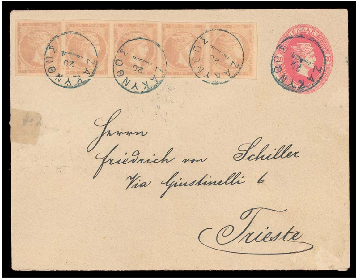
1061 ☒ 1875-1880 ISSUE ON YELLOWISH OR CREAM PAPER P.S. COVER with 20 lep. Large Hermes head printed stamp and 2 lep. strip of 5 (VI. 62), cancelled with "ZAKYNOΣ 20.12.96" to Triest. At that time only the 1896 Olympic games stamps were allowed. Transit and arrival cds. RRR and VF . . . 2000